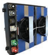
Electric Vehicle Inverter

ATS offers several electric vehicle inverters including a DC to AC propulsion system for battery powered and series hybrid vehicles, a high power inverter for propulsion or generator applications, and a high power inverter system that includes an AC induction motor controller, an auxiliary inverter and a built in dump chopper for regen protection. These units have been installed on airline FBO equipment, military vehicles, and electric trucks. Our propulsion system has been on the Ohio State Buckeye Bullet electric vehicles setting numerous land speed records.