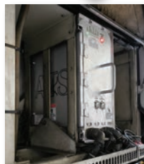
Buck Inverter mounted on monorail