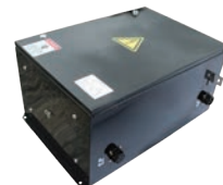
Power Inverter for Air Compressors