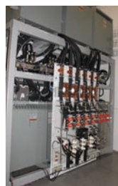
Stationary custom panel work

We have five independent test bays powered from a dedicated 480V AC 1000A supply providing regulated AC and DC supplies for full load testing of all panels.