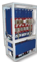
Propulsion Rack Assembly

Systems are running on the Railserve LEAF switching locomotives, the Brookville Co-Gen locomotives, as well as on several in Africa for Grindrod. We also installed the first battery system on a locomotive for Norfolk Southern. We have worked with Loram for many years placing systems on MOW locomotives in Germany, United Kingdom and the U.S.