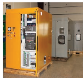
AC and DC Locomotive Traction Lockers