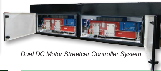
Dual DC Motor Streetcar Controller System