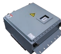
Low Voltage DC/DC Power Supply