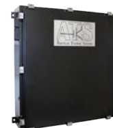
High Power Inverter with Auxiliary Inverter and Regen Protection