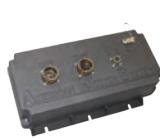
Mini-VFD for Traction Motor Blowers

American Traction Systems has designed numerous components for streetcars and trolley buses, from propulsion systems used on the New Orleans Canal Streetcars and the recent El Paso streetcar renovations, to the power inverter/air compressor VFD unit designed for Niagara Frontier Transportation Authority. Our latest product is the low voltage power supply self powered from a HVDC input.