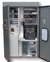
Complete Traction Lockers