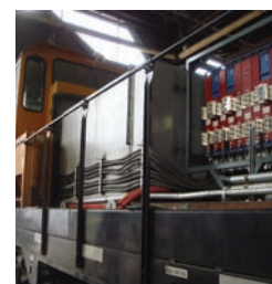
Installation on locomotive