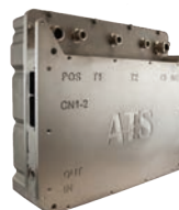
High Power Inverter