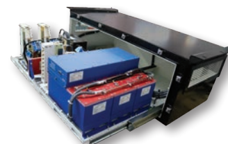
DC Motor Streetcar Controller System