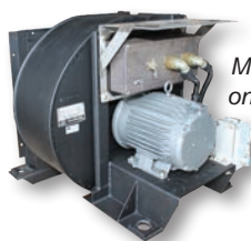
Mini-VFD mounted on blower motor for light rail

**Contact sales rep for additional voltages