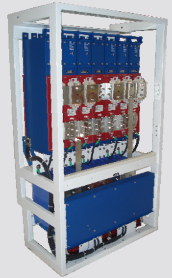
Custom Propulsion Rack