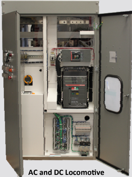
AC and DC Locomotive Traction Lockers

We have experience with Programmable Logic Controllers, PLC's with integrated touch screen, operator stations, VFD controls, DC drives, switchgear and medium voltage cabinets.